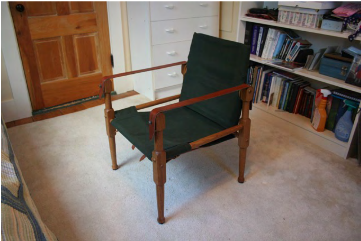
A wood and canvas Roorkee chair. Above: assembled. Below: disassembled for transport.